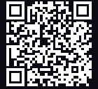
RUT951 360° VIEW